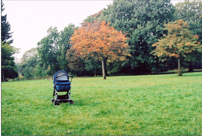
Lena Simic, Contemplation Time: A Document of Maternity Leave , 2007–8, reproduced with kind permission of the artist.

Contemplation Time includes a photograph of a pram on its own, with mature trees in the background, photographed from the point of view of the person sitting on the bench, which may or may not be the mother. We cannot see the baby and there is no one else in view. The pram seems a little too far away, which leaves the uncomfortable possibility of abandonment hovering over the image. The lack of maternal figure in the photograph resonated with one of my interviewees, Zoe, who reflected on her own photographs: ‘there are lots of pictures of her [the baby], but not of me. I am “out of the picture”’ (Interview with Zoe). Her observation brings into focus Julia Kristeva’s argument that the maternal body is always already lost in language because signification, and with it language, depends on the loss of the primary maternal referent: ‘language becomes something like the infinite displacement of that jouissance that is phantasmatically identified with the maternal body’ (Butler in Salih and Butler 2004, p.154). In this understanding maternal subjectivity does not exist in and of itself, but matters only to the extent that it brings another subjectivity into being. During a number of the interviews I felt that the women