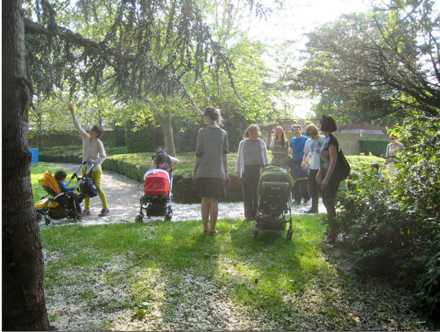
Figure 3: Perambulator, Lewisham, 2012