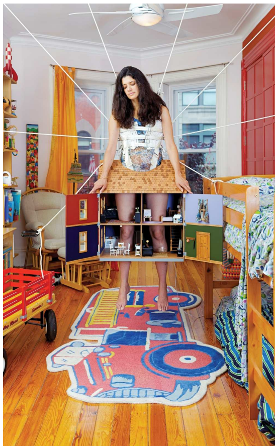
Janine Antoni, Inhabit, 2009